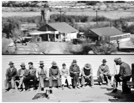
Brown General Store and "the bench" about 1940

10:00 am - 12:00 pm - Speakers and authors available for additional book signing in front of the Museum.