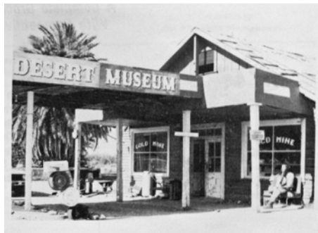
The "Gold Mine" Rock Shop and museum about 1970