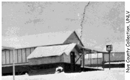
The hospital at Greenwater (with ramp, behind tent) about 1908