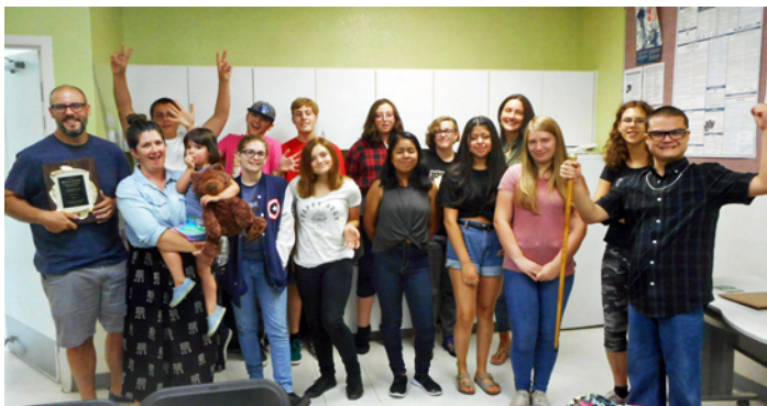
Mojave School students at the Nye Communities Coalition classroom on the last day of class in 2018