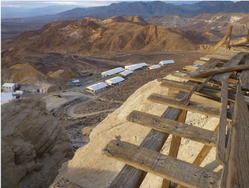
A view of Ryan looking northwest from the Upper Biddy McCarty Mine