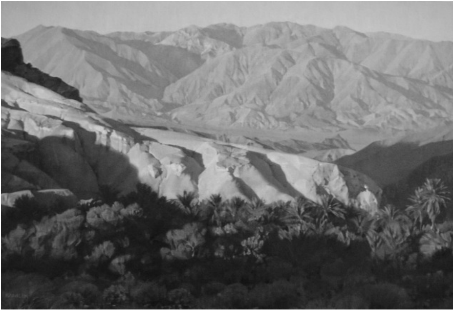
CHINA RANCH