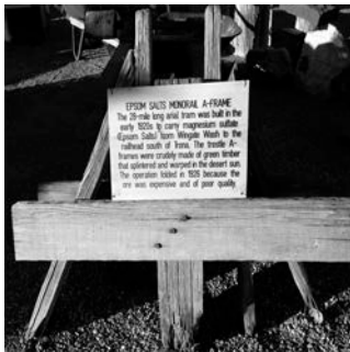
Epsom Salt Monorail A-frame