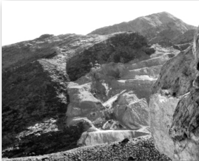
View of the Eclipse Talc Mine from nearby Paddy's Pride Mine

Shoshone Museum Association P.O. Box 38 Shoshone, CA 92384 (760) 852-4524