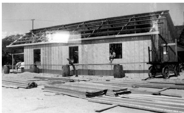
Crowbar under construction