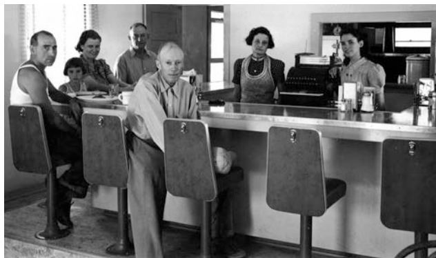
Interior of Crowbar